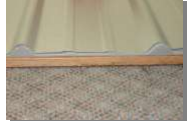
OUTER CLOSURE STRIP